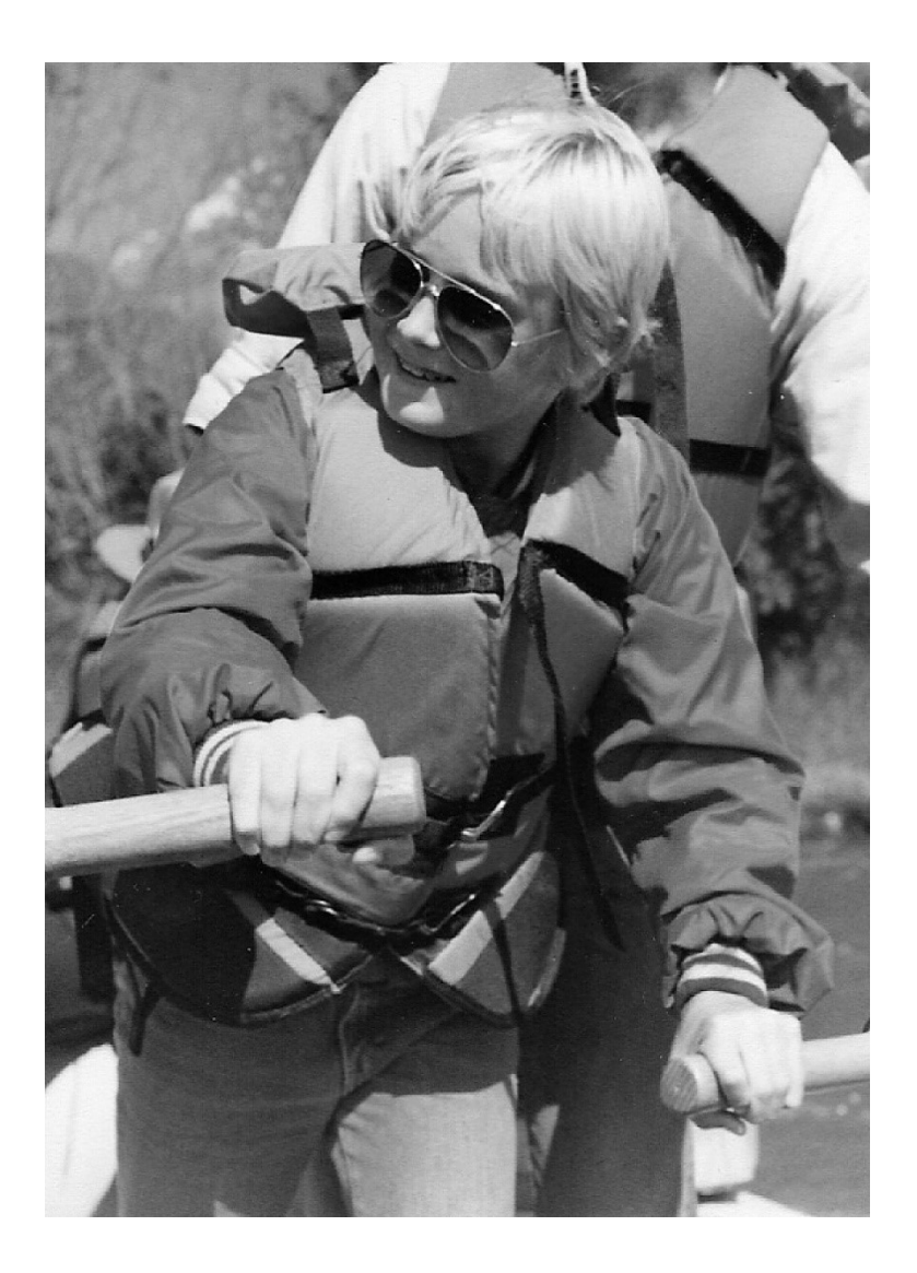
The author guiding a raft on vacation